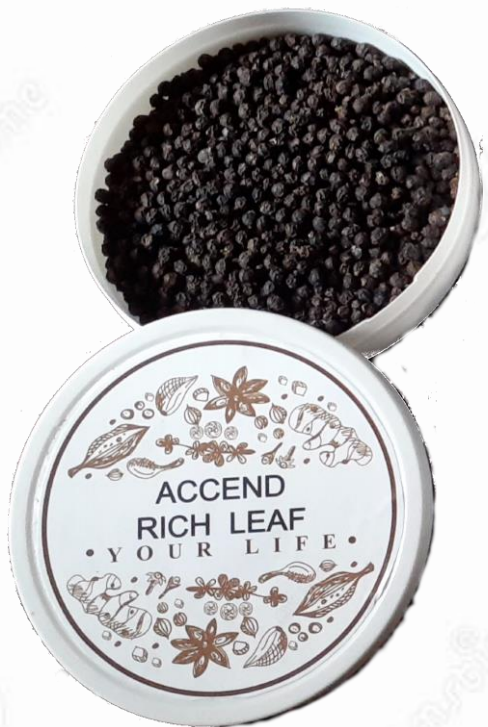
Black Pepper 550 g/l

It's also useful for Weight Loss, reduces Blood Sugar levels, improves Brain Health, treats Gum Inflammation, reduces the occurrence of Cancer, etc.