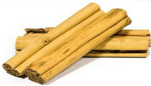
H2 - 1 ST GRADE