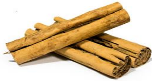
H2 - 2 ND GRADE