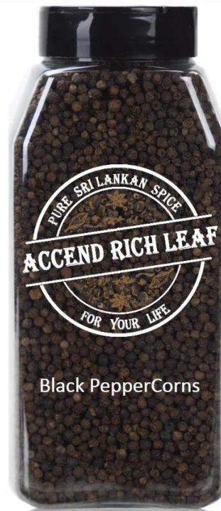
Black Pepper 500 g/l